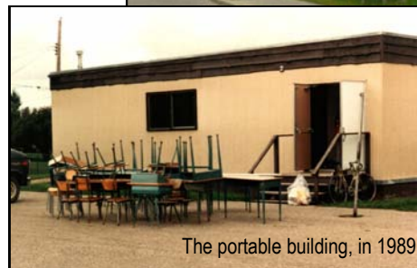
The portable building, in 1989

It's been nearly 22 years since Central Alberta Christian High School first opened its doors. How did it all begin, and what changes has CACHS seen over the years?