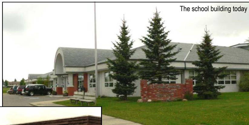
The school building today