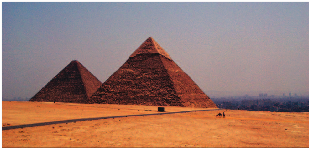
Ancient Pyramids of Giza