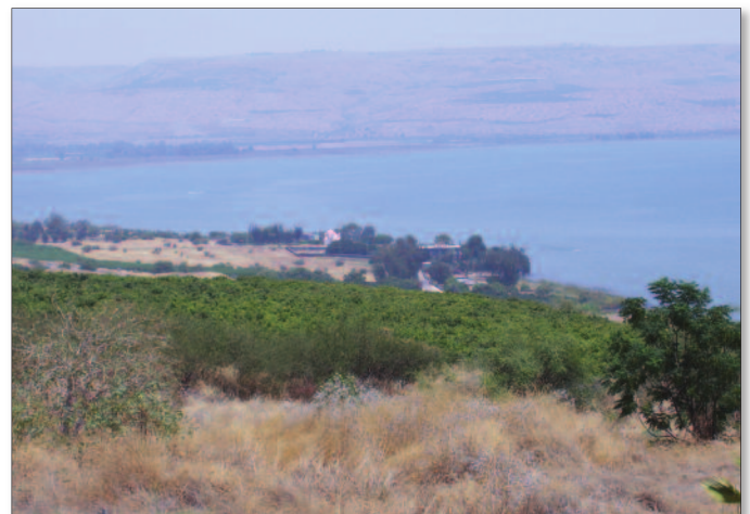
Sea of Galilee, viewed from the Mount of Beatitudes