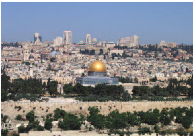
Temple Mount, viewed from the Mount of Olives