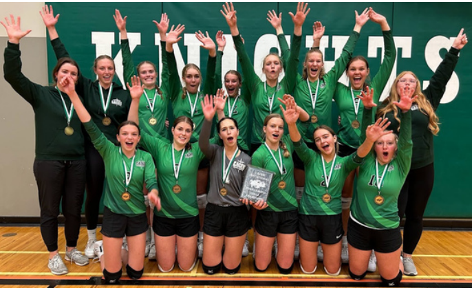
Girls Volleyball team after their home tournament win!

with student-athletes currently participating in volleyball, hockey, and basketball getting started in November.