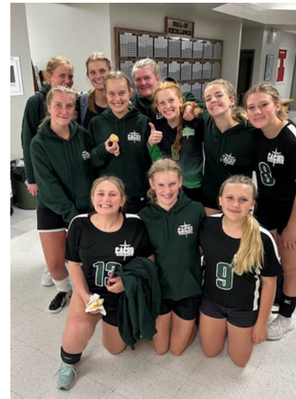
Girls Junior Varsity Team