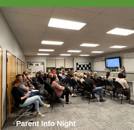
Parent Info Night