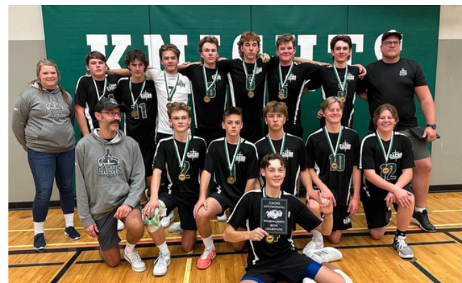
Boys Volleyball team after the home tournament win! <-- Scan QR code to access the YouTube Channel!