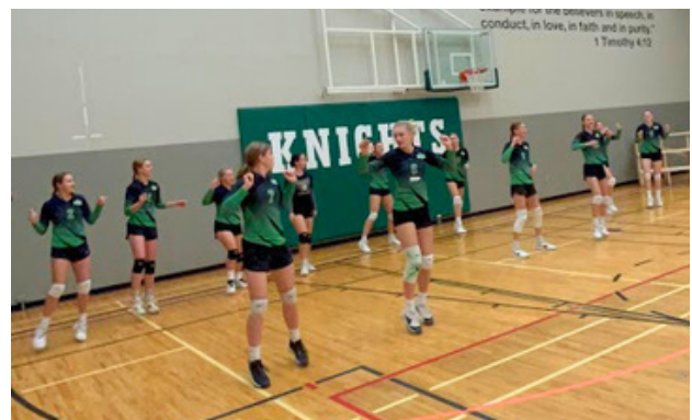
The girl's team have a fun warm-up routine! Scan the QR code to check it out!