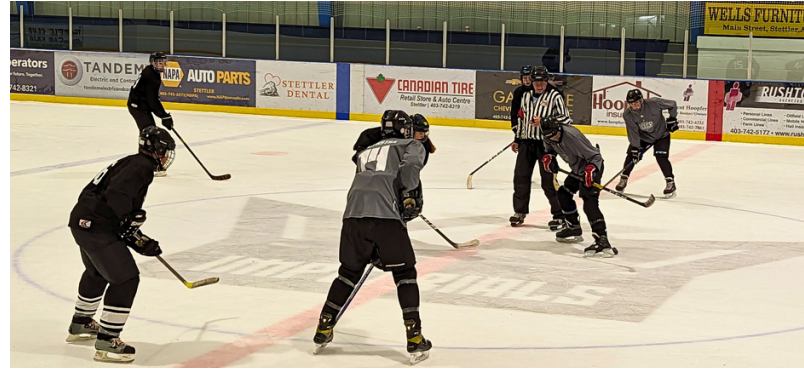
Then hockey team playing in Stettler

Our hockey season continues along with games on Friday and Saturday evenings, and practises every Monday morning at 7am.