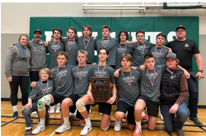
Boys Volleyball team winning 1st place in the Zone Championship