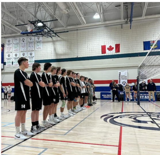
Boys Volleyball team at Provincials

Scan QR code to access the YouTube Channel!