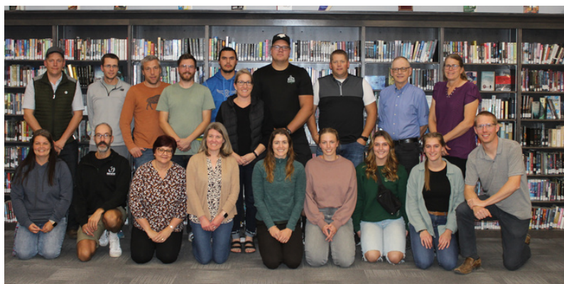
Our amazing team of coaches! (A few are missing from the photo).