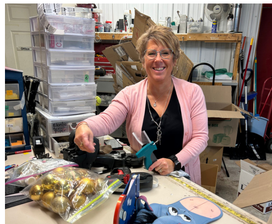
Some of the amazing staff and volunteers!