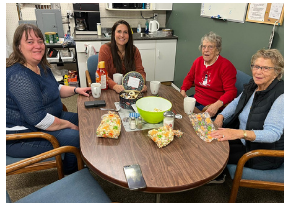
Amazing Building Blocks Staff & Volunteers!