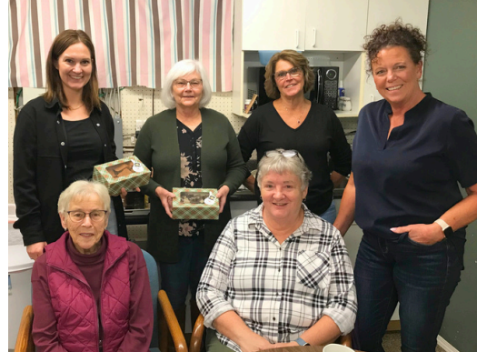
Thank you to all the amazing Building Blocks volunteers!