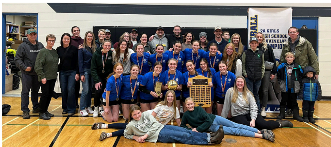
The Senior Girls team after their final game at Provincials with their fans!