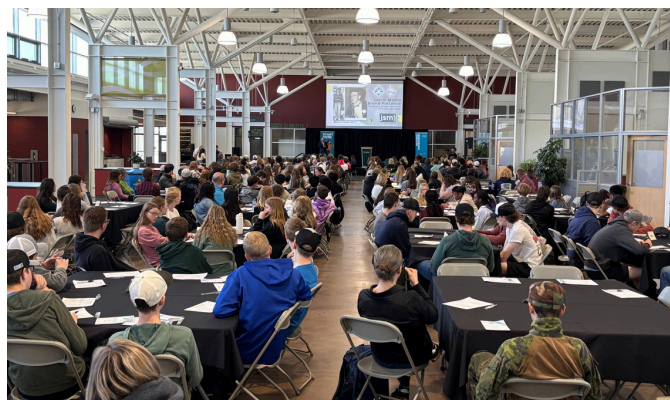
Grade 10's attended World Of Choices at RDP

World Religions: Comparing denominations within Christianity.