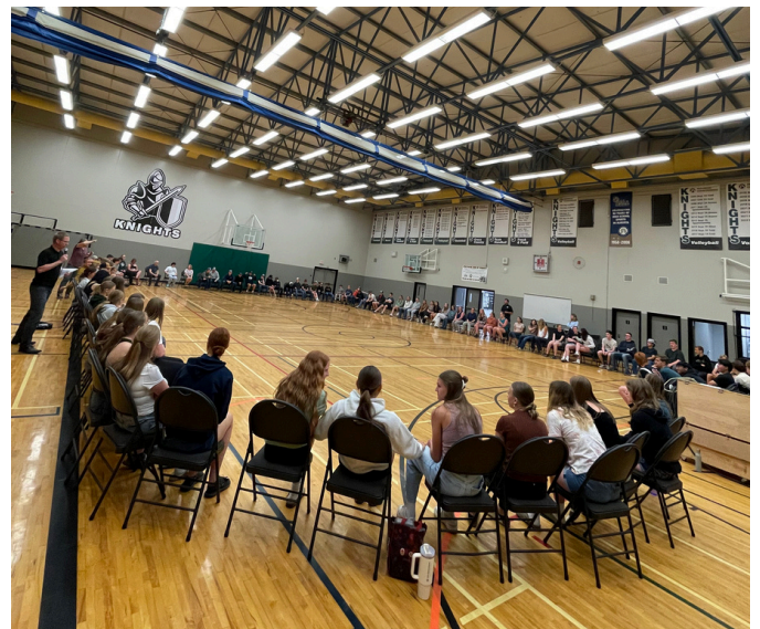
Post assembly activity with the entire student body.

Starting in September, I will be working with the CACHS Board to begin creating Strategic Plan 2030. Over the coming school year we will create opportunities for our stakeholders to voice their ideas, dreams, concerns, and hopes for Central Alberta Christian High School. As we reflect on God's faithfulness to CACHS, we also continue to Strive for Excellence in Christ as we together offer Transformative Education within a Christian Community. 🏈